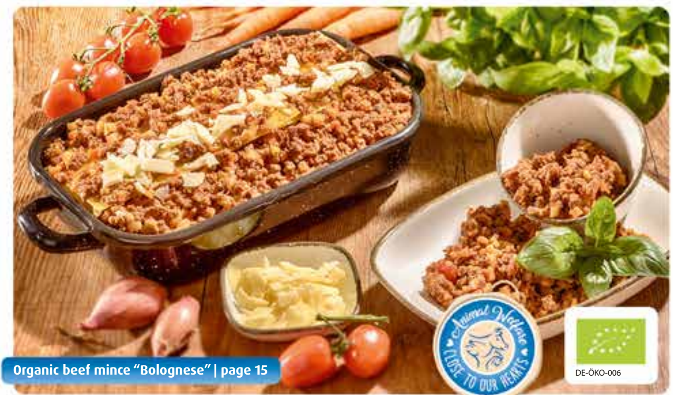
Organic beef mince "Bolognese" | page 15