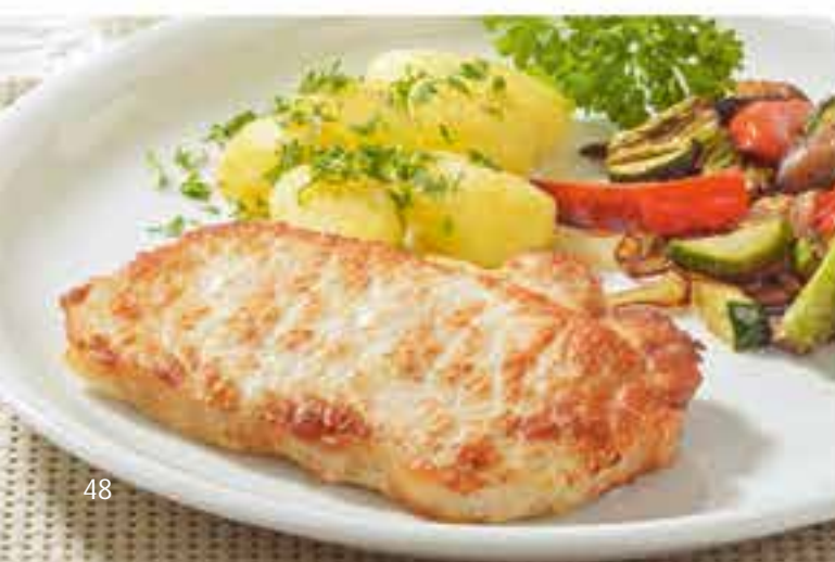
Saddle of pork steaks, cut from the cutlet, no bone, IQF deep-frozen, 160 g

Fresh saddle of pork steaks, cut from the cutlet, no bone, IQF, in pillow bags