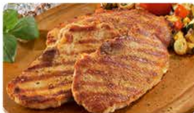
Pork topside steak, uncooked, neutrally seasoned, IQF deep-frozen, 160 g

Made from pork loin or topside, it's pure meat heaven!