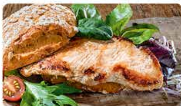
Pork fillet steak, roasted, liquid seasoning, IQF deep-frozen

Fresh pork fillets with liquid seasoning processed into steaks and roasted on both sides until golden-brown, IQF, in pillow bags